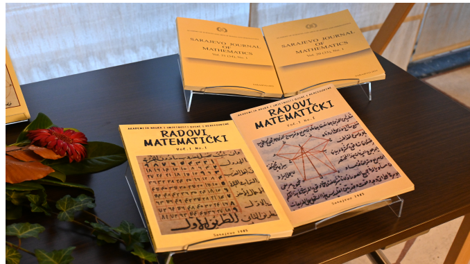
Old and new mathematical scientific journals, Radovi matematički and Sarajevo Journal of Mathematics